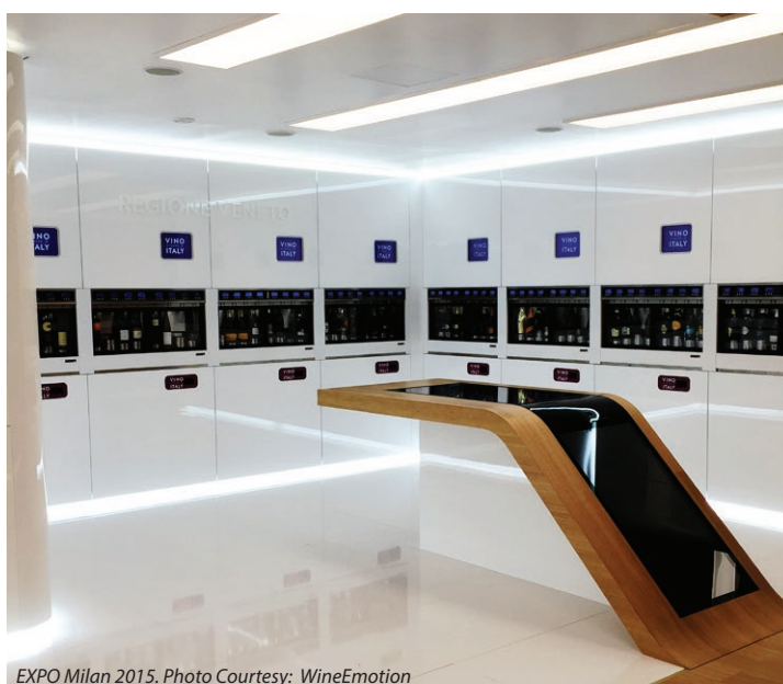
EXPO Milan 2015.

IN VINO VERITAS: A NIGHT FULL OF GLAM AND GREAT WINE WITH WINEEMOTION Enjoy a fantastic night in Bangkok, the city that never sleeps, with a glass of wine and a plate full of delights.